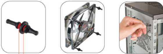
For fan part For case part